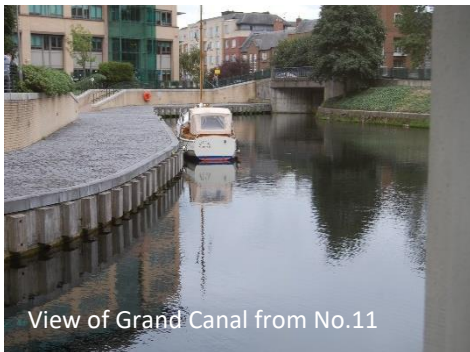
View of Grand Canal from No.11