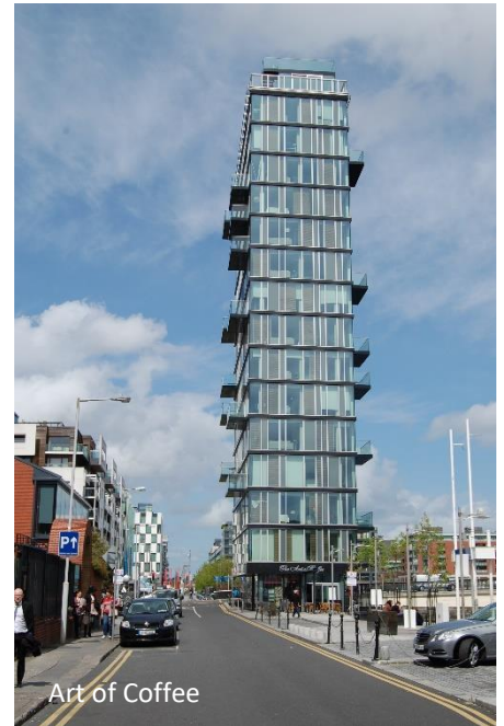
Art of Coffee